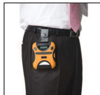
Belt Clip Included